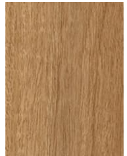
556 Spotted Gum