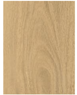
525 Alpine Gum